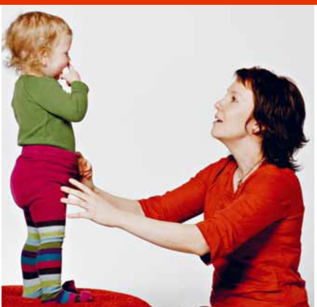
... makes room for the child's initiatives to interact.