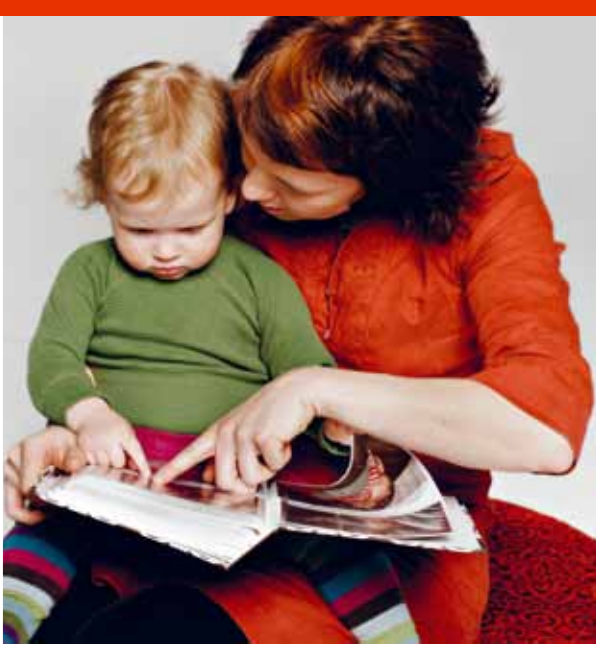
... checks whether she and the child have understood each other.

sionals (e.g. speech therapist or psychologist) at your child health center (neuvola).