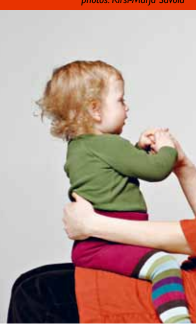
... notices the child's initiatives and responds to them.