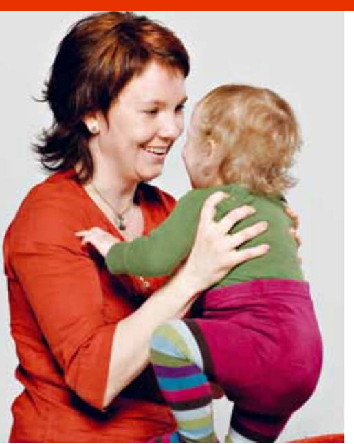
.... has unhurried time for the child.